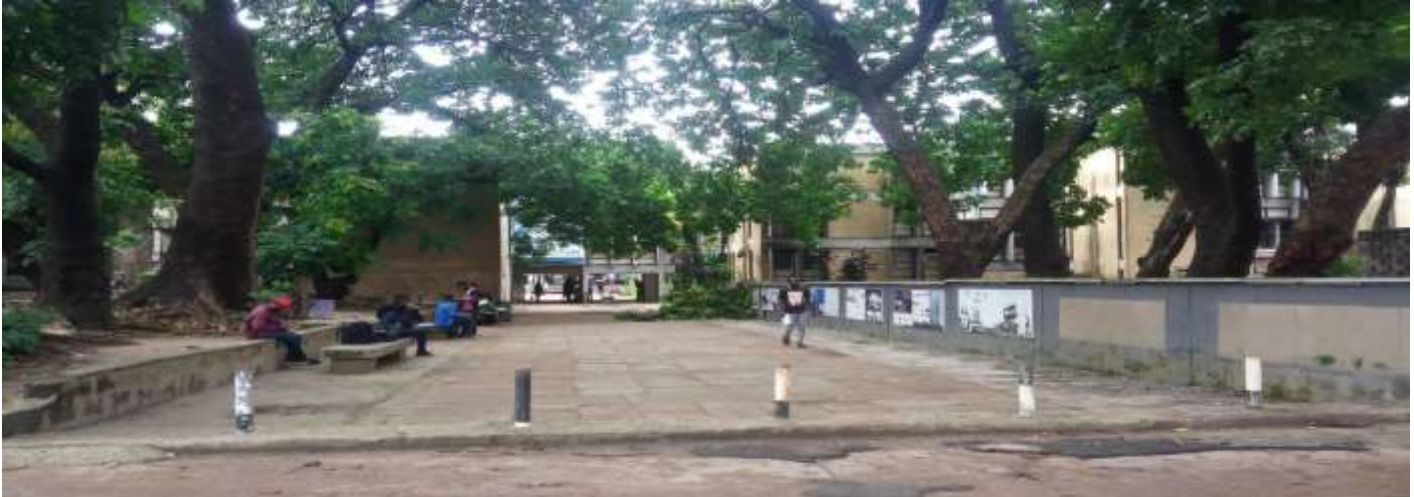
Plate 3: Multi-function Open space connecting the faculty to other buildings